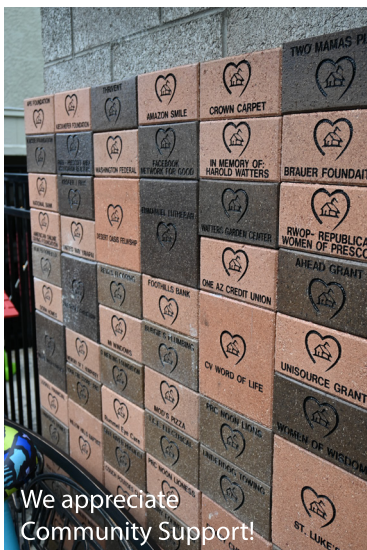
We appreciate Community Support!