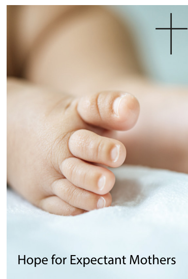
Hope for Expectant Mothers

"It has been years since my daughter has had a bed!"