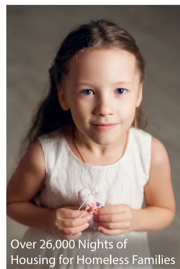
Over 26,000 Nights of Housing for Homeless Families